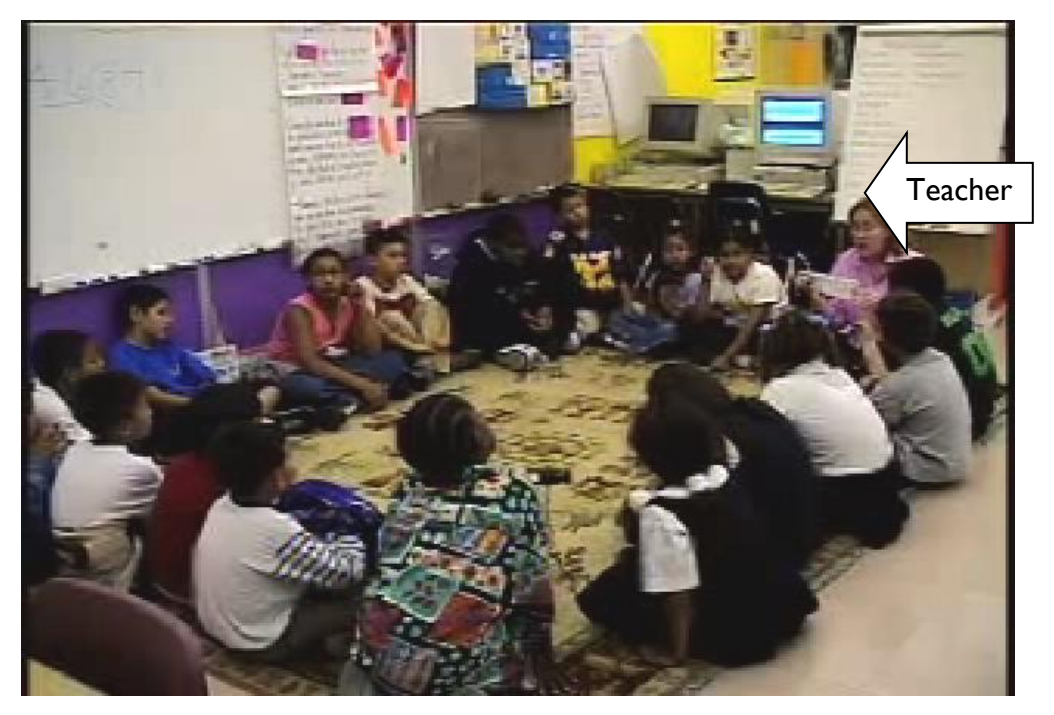
Figure 1. Community circle time activity

of sharing time as an affective space, a normative space, and in the construction of shared knowledge. My observations of Community Circle time interactions reflect a recurring and consistent classroom participation structure. Figure 1 displays the spatial and corporeal configuration of Community Circle time in Mrs. Torres' classroom.