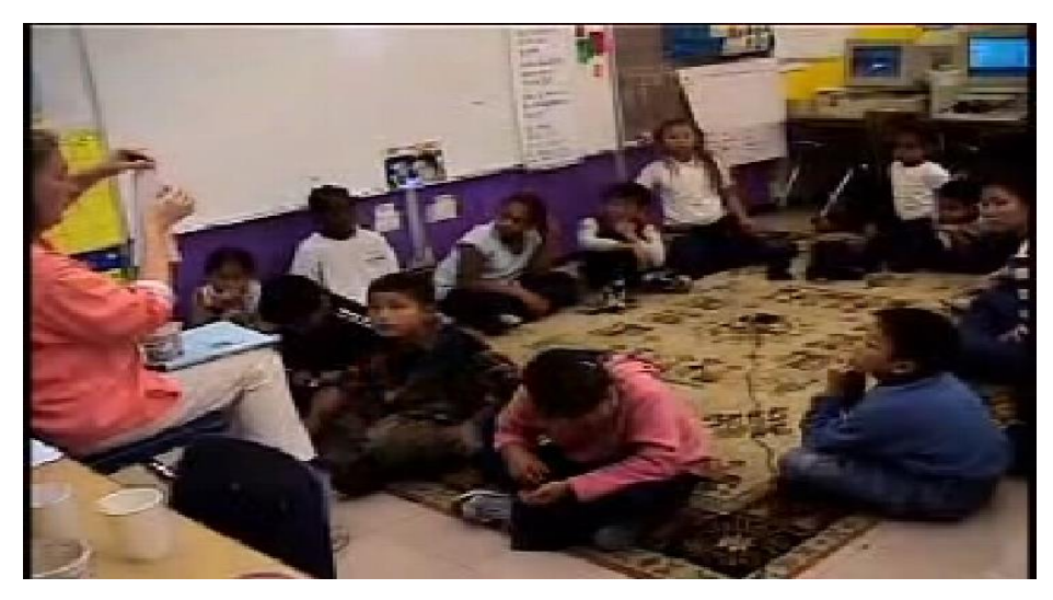
Figure 4. Teacher introducing measurement activity with paperclips and straw

straw (a tube of waxed paper) of different lengths. This discussion takes place in the Community Circle carpet and students share answers from the activity that took place previously at their desks. It is agreed that most everyone works out the same length measuring the piece of paper using the paperclips, but there was disagreement with the answers using the pieces of straw as a measurement tool. The teacher starts by repeating the different solutions shared by the student groups involving the pieces of straw.