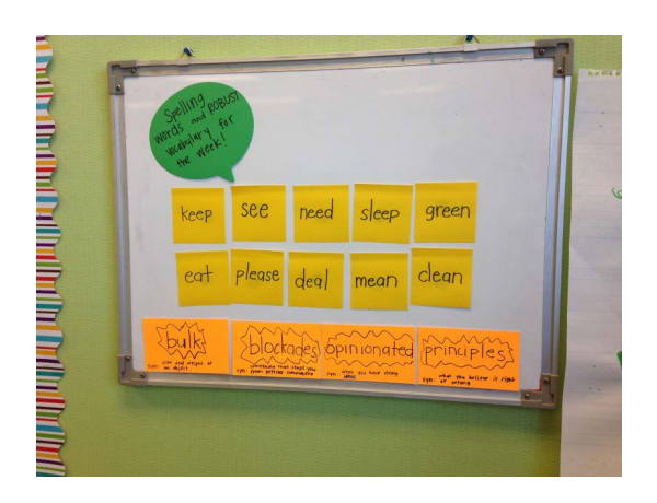
Figure 2. Word Wall in Lisa's Classroom

Building connections (Gee, 2005) between the D/discourse of word walls and assessments, Lisa utilized her realization to inform individualized assessments with Maria. After collecting data through a FoK interview and community walk, Lisa recognized how the word-wall term "bulk" in the context of grocery shopping, presented a challenge for Maria who "rarely goes grocery shopping" (FoK assessment October, 2013). Negotiating the deficit-based Discourse model, Lisa connected the role of ELs' FoK and Discourses in language learning with the assessment of academic vocabulary, realizing that it is "crucial to understand FoK so activities and assessments can be linguistically appropriate and yield authentic assessments" (Case study, p. 4). As such, Lisa built awareness of the need for culturally valid assessments drawing on students' FoK; however, she struggled with the practicality of finding time to assess individual students within rigid daily schedules. She reflected, "The rigor of the daily schedule puts a lot of pressure on the teacher...but it is all within the teacher's realm of power to administer FoK interviews" (Case study, p. 5). Lisa's field experience mediated her recognition of the value of FoK in authentic instruction and assessment and her agency to create time for FoK.