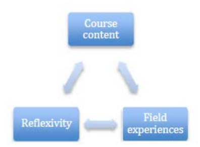
Figure 4. Academic Dimensions Mediating Candidates' Learning