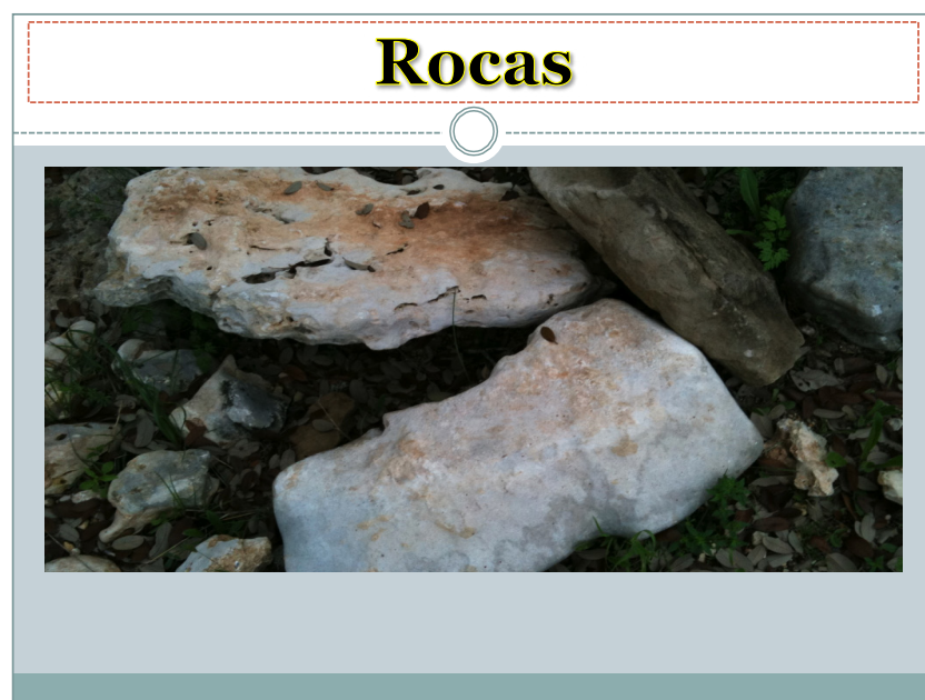
Figure 1. Objects found at a students' home.

During the first day of presentations, seven students described their projects. In most cases, students included pictures of objects and living organisms found at home such as a chair, a tree, and other items randomly selected and categorized under science or mathematics related topics such as states of matter, living things, geometrical figures, etc. Once again, the instructor noticed the cultural disconnect initially identified in the students' weekly blogs. After all presentations had concluded and an open discussion began, the instructor used a student's picture of rocks (see Figure 1) to pose a variety of questions. Field notes of this discussion reflect students' ideas of what they perceived as valid representations of scientific/mathematical knowledge with cultural relevance.